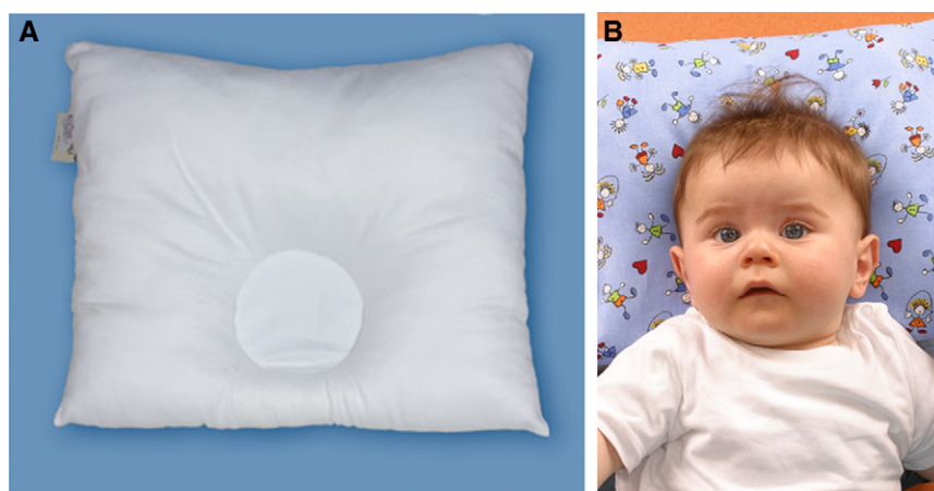
Figure 1. A, The BabyDorm bedding pillow. B, Use of the bedding pillow.

Using an additional covariance analysis to adjust the groups for baseline differences regarding severity of cranial